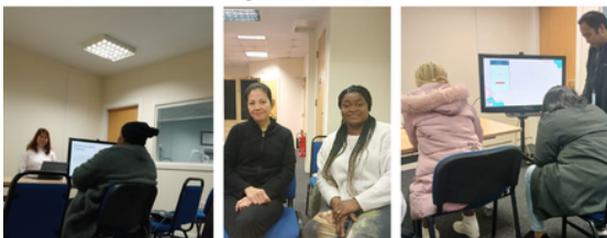
(Staff completed Induction Training)